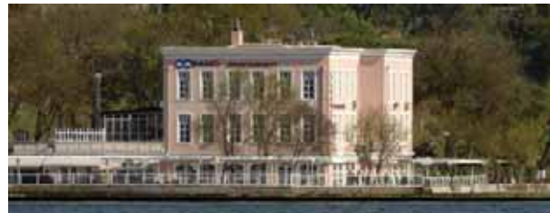
Sabancı Teachers Center, Anadoluhisar, Istanbul

Considering the changing roles of foundations and the dynamics of the foundation sector in the national and international arena, the Sabancı Foundation continues to support programs and innovative approaches which contribute to social development and improvement of living standards. In 2008, the Foundation will maintain support for current areas of work while concurrently developing and implementing activities within the new strategic framework.